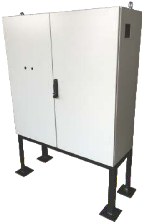
Double Door Control Panel Enclosure